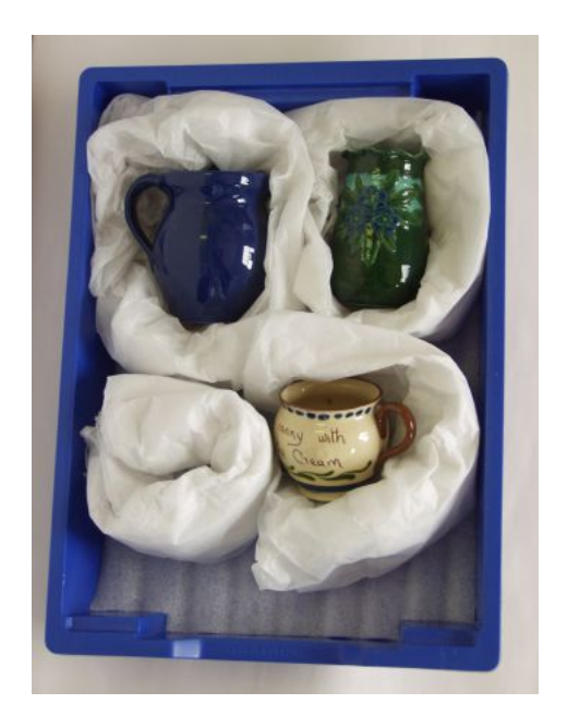
Packing objects to transport