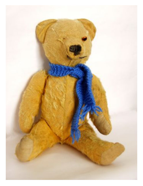
The sentimental value of some objects is enormous.

This is a game that can develop in a number of ways. Using the objects themselves, cards with pictures of each object or pieces of paper with drawings/words on, group the objects together. Place all the 'high status' objects in one group. This could mean objects that are financially valuable, objects used or valued by members of the ruling groups in a culture or perhaps objects that are likely to have great (sentimental) value. Group the other objects into middle and low status or value groups. This can be done as an exercise in smaller groups and can lead to some excellent discussions about the different ideas of value and importance attached to the things around us.