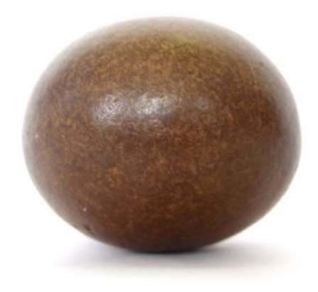
A cannon ball? A bowling ball? In fact it's a hair ball found in the stomach of a cow!