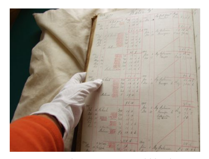
Wearing gloves to open an old book