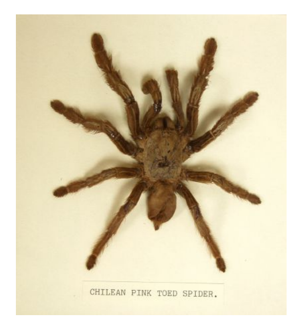
It's a scary specimen!

The vast majority of sessions will focus on creativity, curiosity, discovery and imagination but fear, trouble and sadness are also feelings that can emerge. Be prepared for these. One of the most important elements in these situations is to make the person who is experiencing difficult feelings appreciate that they are not alone. If a child finds grief welling up when they see an object that is somehow associated with a recently deceased family member, make sure they know their feelings are not unique. This is not the same as asking them to 'buck up and get over it'. Rather it is about acknowledging our shared human condition. Those of us who have not experienced grief will inevitably do so at some stage in our lives. Those who are experiencing it now need to know they have the understanding of those who share their feelings and the respect of those who have yet to feel that way.