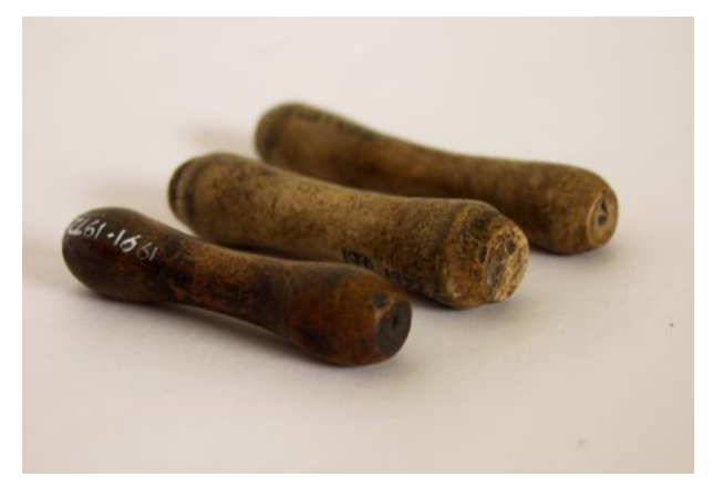
So what are these mysterious objects?

Is it a replica or the real thing? Each person could give a plausible story of how the object was discovered or perhaps how it was made in factory only weeks ago?